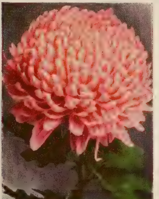
PINK CHIEF 50c each; 3 for $1.25